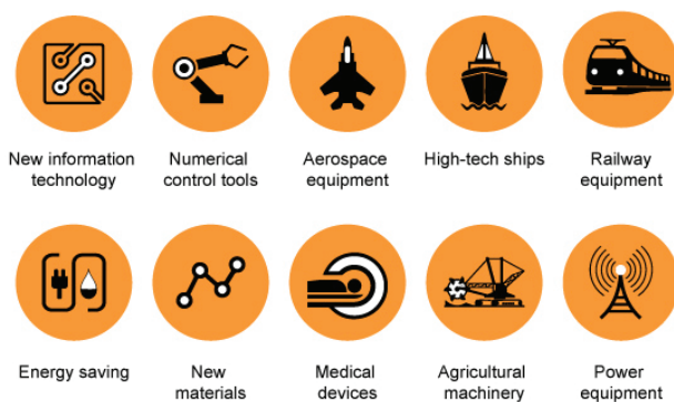
Figure 1: The key sectors that will benefit from MIC 2025