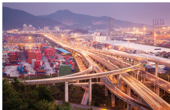
Figure 4: The city of Shenzhen in the Guangdong Province, often hailed as China's Silicon Valley

Although there is an overall departure from the SEI initiative, MIC does fall in line with China’s 13th Five-Year Plan (FYP) by seeking “to advance indigenous innovation and build global champions through linkages with other plans”. There is an overlap between MIC and FYP in industry focus and overarching policy direction, with FYP highlighting the “critical importance to the government’s leadership in advancing indigenous innovation, achieving technological